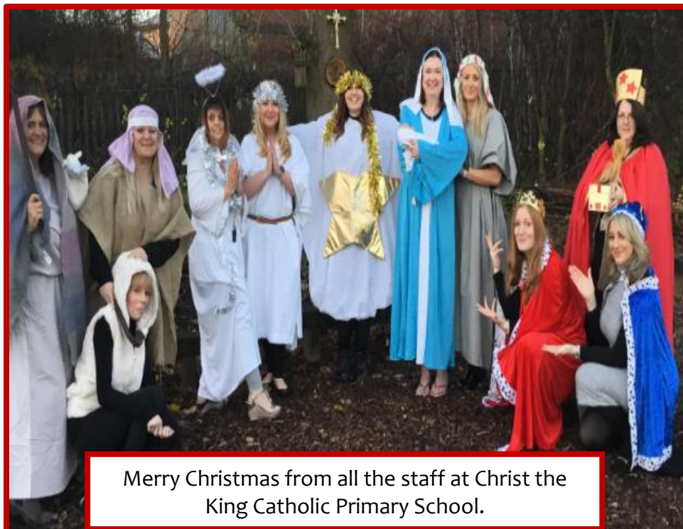
Merry Christmas from all the staff at Christ the King Catholic Primary School.